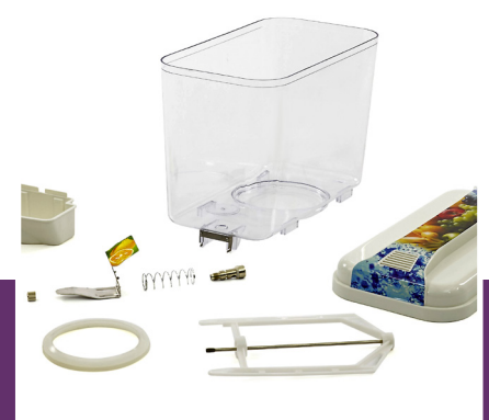
Easy to dismantle and clean