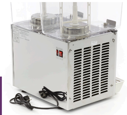
Automatic temperature regulation, variable from 7°C up to 12°C